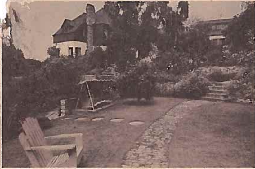
From Lower Garden Terrace