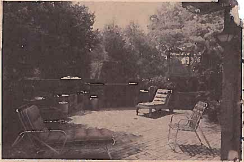
Fireplace and Electrically-Equipped Barbecue in Patio

This beautiful "show-place" home and garden built to order of the owner twelve years ago.