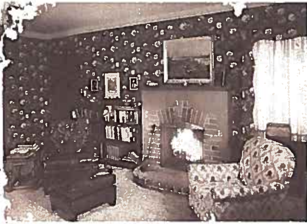
Upstairs Living Room