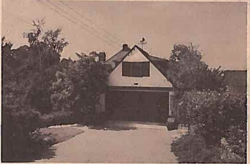
Garage Entrance from Street — House in Background