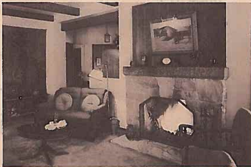
Corner of Living Room