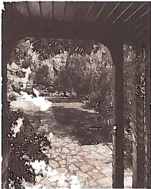
Front Porch Entrance to Garden