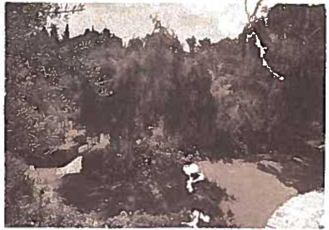
Corner of Front Garden