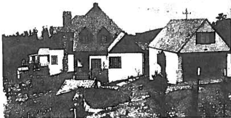
Three weeks after occupancy, the Jay Smith garden looked like this picture.

is recorded here. As in most successful hillside gardens, the recognition of the space gaining values of successive levels is well illustrated. Bulkheads and retaining walls support wide terrace capably.