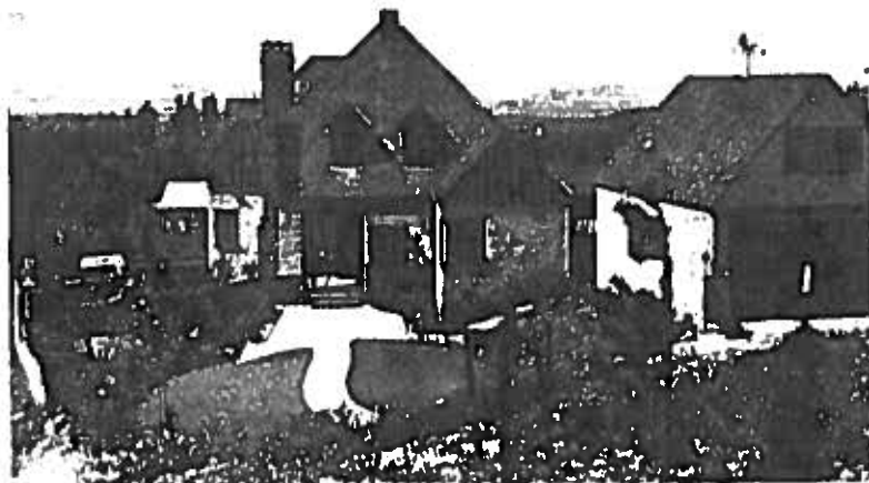
The same garden later in the same season. Barbecue "room" at the lower left.